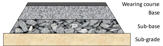
Fig. 2. Road layers.

it on the road using a grader; and packing it using a compactor. This is repeated in multiple iterations adding layer by layer. Often, material is stockpiled at various stages of the process to cope with varying production rates of machinery.